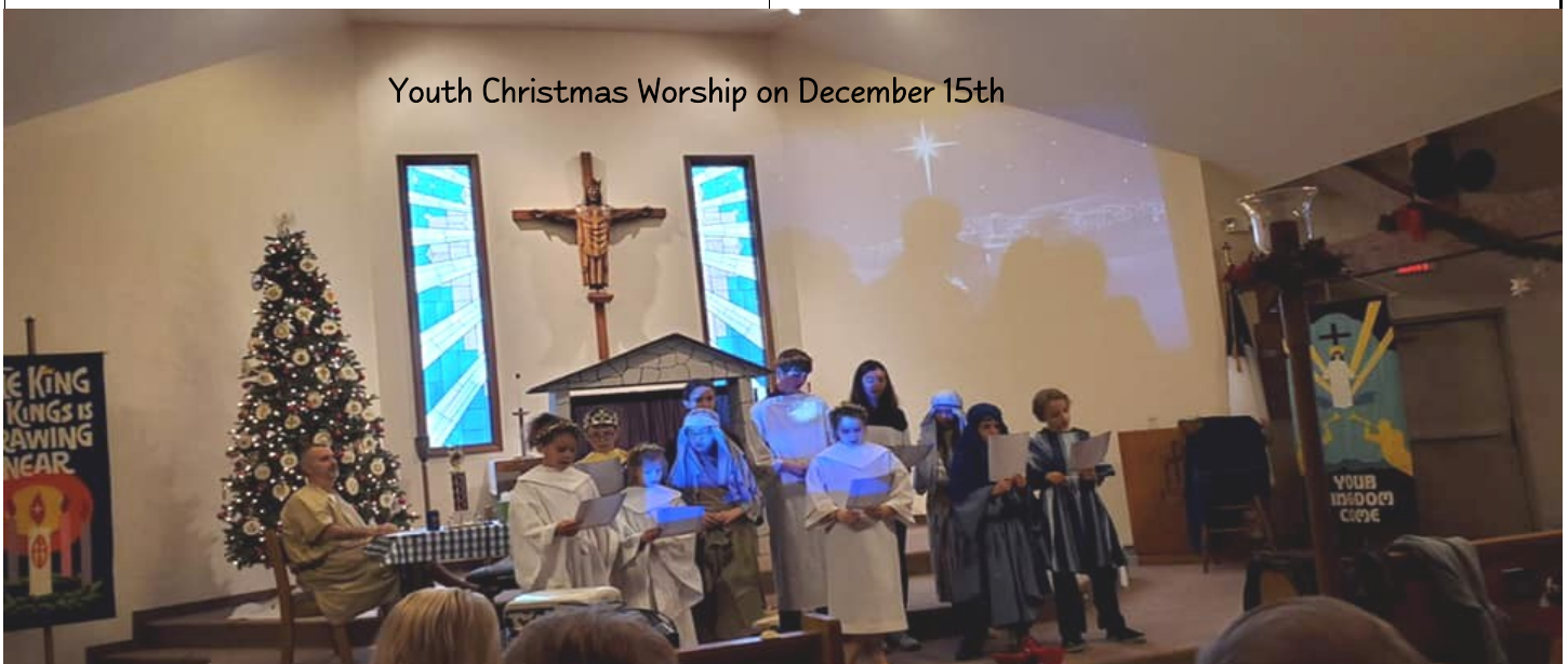
Youth Christmas Worship on December 15th